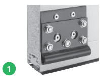
1 Heavy duty bottom roller bracket designed for easy rolling.