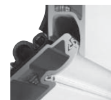
8 PVC joint cover guards against oxidation streaking. Sloped design with weather seal keeps moisture out.