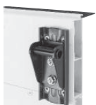
10 Top closure bracket can easily be adjusted to ensure top panel provides tight seal at top of door.