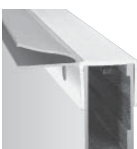
11 Vinyl top seal standard.