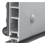
9 Bottom panel is fitted with a rubber seal to provide protection from the elements.