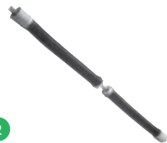
2 2 cable balancer with independent springs for each cable. Springs treated with rust preventative.